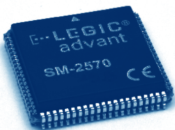
Programmable SM-2570(C) with integrated Application Processor

✓ Programmable high performance for universal readers